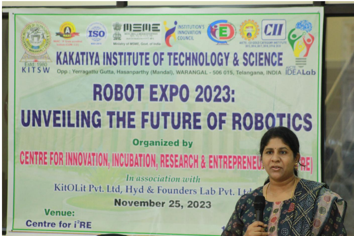
CEO-FOUNDER OF KITOLIT explaining about their company