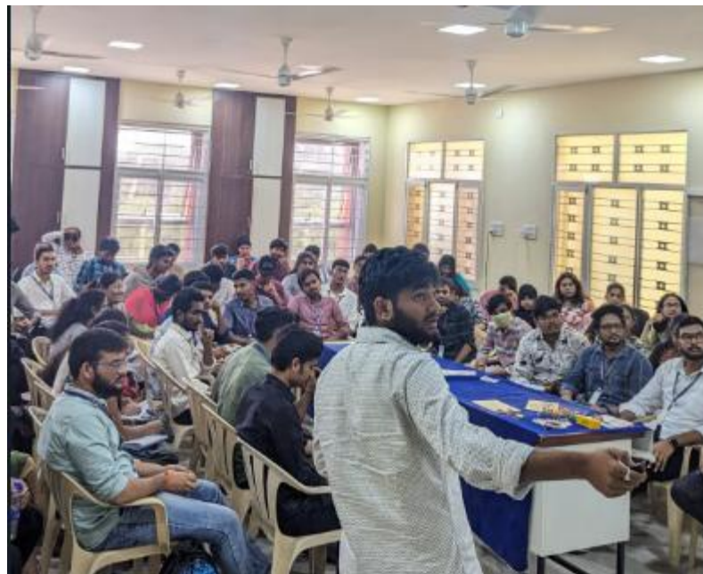
Explaining to students the types of drones and working procedure of drone and factors affecting.