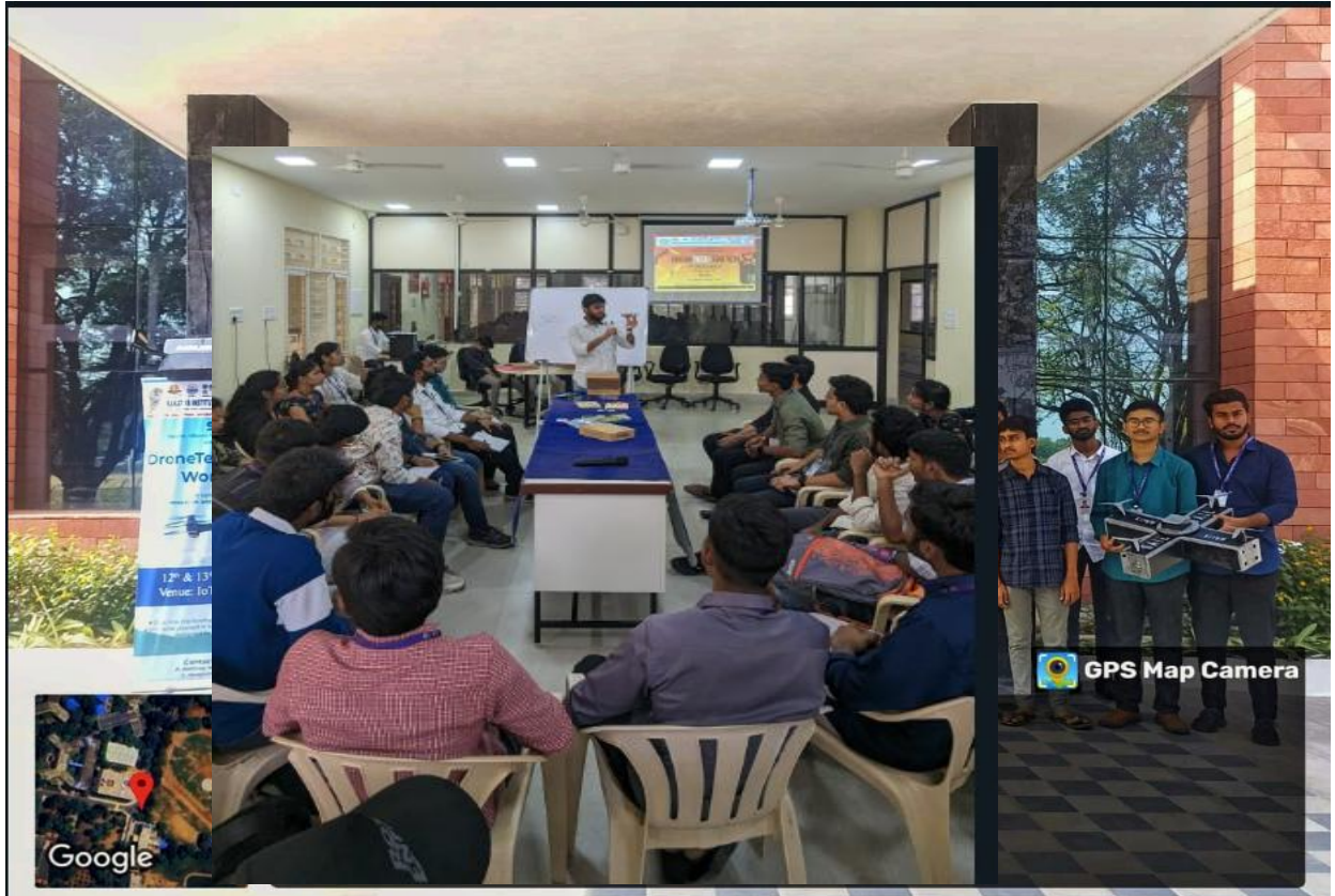
A picture with all the participants of drone tech ignition workshop.